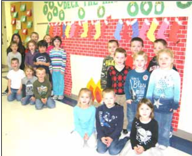
Kindergarten is pictured by their fireplace and Christmas stockings.

Bethlehem Lutheran Ch.-Sun. 9 am; SS 10 am Immanuel Lutheran Ch.-Sat. 6 pm, Sun. 8:30/11am; SS 9:45 am St. Paul's (Blue Point) Lutheran Ch.-Sun. 9:30 am; SS 8:30 am Zion Lutheran Ch.-Sun. 9:30 am; SS 8:30 am